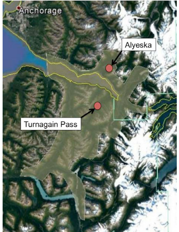
Fig. 1: Shaded area includes the Seward Highway corridor, with Alyeska and Turnagain Pass labeled.

rain/snow line to fluctuate from sea-level to ridgetops creating high variability in the snowpack with respect to elevation. Truly the "land of extremes", the region also sees unique micro-climates, for example, continental snowpacks sit roughly 15 miles from maritime snowpacks (Wagner, 2012). Furthermore, solar impacts at 61 degrees North are minimal from November through February, until the sunlight returns rapidly in March and April. Despite this, winters more often than not begin warm and wet and these seasons tend to be the years with the most glide activity. Typically cycles occur during the early winter and spring. However, occasionally this region will see mid-winter glide cracks and releases.