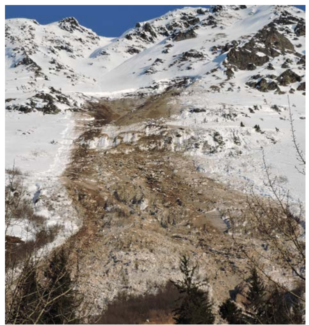
Fig. 3 "92 mile path" winter 2015/16 typical glide avalanche

The winter weather contributed to an above average snowpack above 1,500 feet and a below average snowpack under 1,500 feet. Generally there was no snow on the ground from sea level to 1,000 feet. The avalanche paths along the most active glide avalanche zone consist of complex starting zones. Individual avalanche paths are not easily identified but are instead broken into areas with a path name as the identifier. Many of these avalanche paths have a vertical relief of 3,000 to 4,000 feet. Combine these factors and add in the unpredictability of glide avalanches, lack of mitigation options, and a major transportation corridor; this may lead to problematic avalanche hazard considerations.