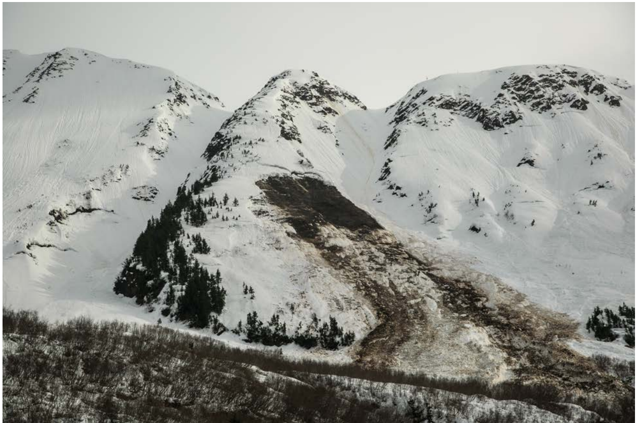
Fig. 2: A D3.5-R4 glide avalanche occurring on The Facet slide path within Alyeska Resort's prime North Face terrain.

through the post-season maintenance period, until snowmelt had reduced the volume enough to simply remove the hazard.