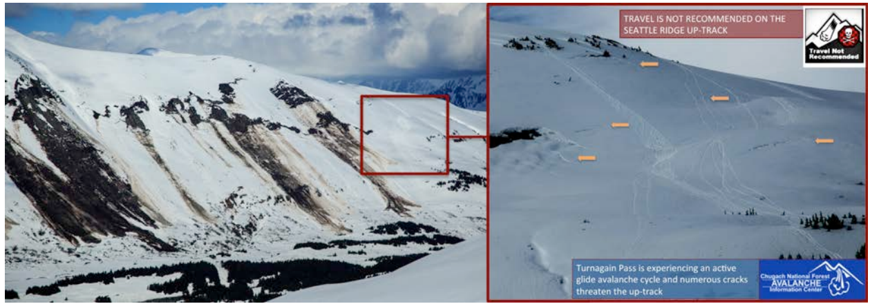
Fig. 5: An example of a CNFAIC social media post that urged backcountry users to avoid certain popular slopes with active glide releases.

We did our best to document the glide activity with notes, photographs and diagrams. Before and after photos were the most effective at visually illustrating the 'unpredictability' of glide releases. However, it was impossible to consistently capture 'before' photos on a daily basis of our entire region due to poor visibility, stormy weather, and 1,000's of acres of terrain not visible from the road corridor. One of the most helpful tools was a timelapse Road Weather Information System (RWIS) web camera pointed at a slope called "Repeat Offender," adjacent to the up-track mentioned above on the popular snowmachine area of Seattle Ridge. These time stamped images became key in discerning time of release. These were some of the few glide avalanches that we had an approximate time of day when they released. There were a few lucky observers who saw glide avalanches happen and had exact times.