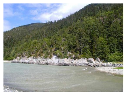
Exhibit 1. Photograph taken July 27, 2003 of the Katzehin Ferry Terminal site.

effort resulted in a refined boundary for the estuarine emergent wetland located at the Katzehin Ferry Terminal site. Neither the Katzehin Ferry Terminal location nor the Katzehin River delta was mapped for the JAI Project with an NWI code that would indicate the presence of mudflats. Typical NWI codes characterizing mudflats begin with E2US3 (estuarine, intertidal, unconsolidated shore composed of mud). No mudflats were mapped in these two areas during the original effort or any of the subsequent updates. Wetland mapping performed in 2004 and subsequent years occurred on a digital orthomosaic aerial image taken in 2003 with a pixel resolution of 1.5 feet. The 2003 aerial