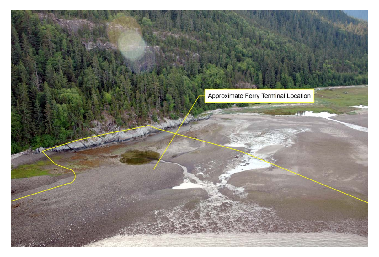
Exhibit 3. Photograph of the Katzehin Ferry Terminal site from the ShoreZone website (NOAA 2014). Photo taken June 4, 2004 looking southeast.

The discontinuous marsh documented in the third across-shore component of ShoreZone ID# 3 accounts for the emergent estuarine wetland currently mapped. Rocks and gravel are present in all across-shore components in all areas where the proposed ferry terminal would be located. The smallest particle size mapped by ShoreZone in the area is sand.