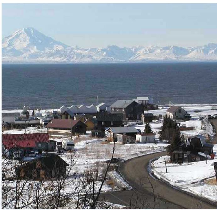
Ninilchik, Kenai Peninsula Borough

Or P.O. Box 110800 Juneau, Alaska 99811-0809 (907) 463-4750