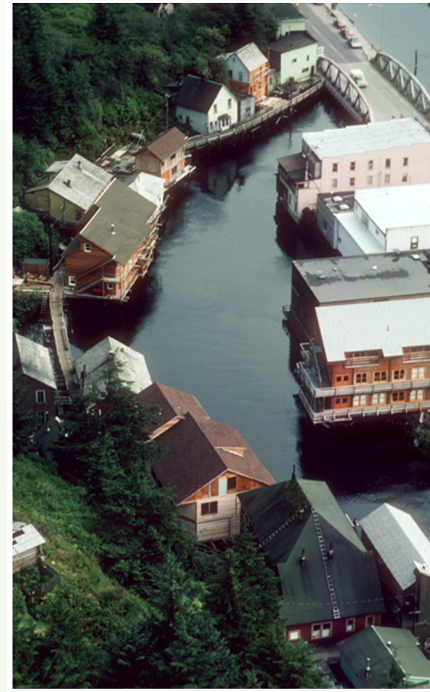
Ketchikan Gateway Borough

AS 46.40.100 provides that municipalities and State agencies shall administer land and water use regulations or controls in conformity with district coastal management programs that are in effect.